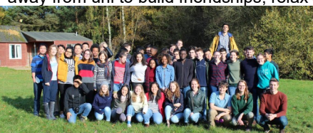
The group shot!