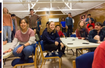
The traditional game of Sinky-Floaty