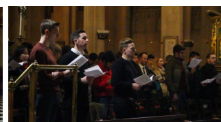
Singing all the carols