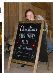
Fairy lights were plentiful