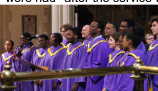
The IC Gospel Choir