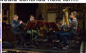
Royal College of Music students leading the carols