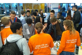
Fresher's Fair Stall

This year we were able to kick off CU mission before freshers week by helping freshers from 4 halls move into their accommodation. We then had an events packed week with Freshers Fair, 3 'Skeptical' lunchbars, a 'Hangover Breakfast', Afternoon Tea for International students, several Club Missions as well as HUB. We had over 100 people sign up to the mailing list and had many new and returning students attend the events throughout the week. Over the following month we ran a 'Church Search', helping Christian freshers to find a Church family in London. Praise God for all the people we were able to meet and welcome over the week, as well as sufficient resources, smooth logistics and church workers providing extra sets of hands.