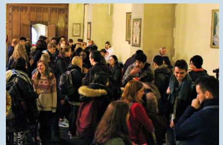
Refreshments and conversation post-service

The event went amazingly well overall, and we will be praying for God to work in the hearts of all those who have come this Christmas.