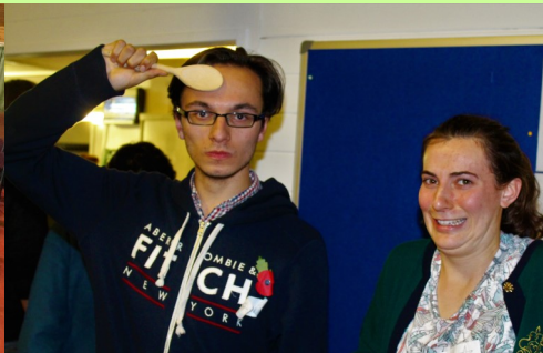
Crumble song demo