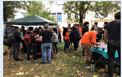
Hangover Breakfast draws a crowd of eager freshers

Our first weekly “HUB” meeting saw an impressive number of new faces, which we were immensely heartened to see. Having seen a number of beloved seniors graduate in the summer, we praise God for answering our prayers and bring in plenty of freshers into the CU.