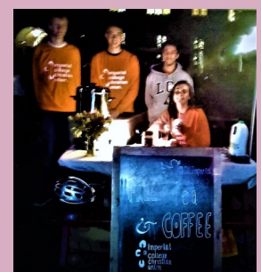
Blur photo, but minds keen for the Gospel

In Club Mission we aim to show Christlike love to fellow students at the bar, through chatting over tea and biscuits at the booth, and give a helping hand when they need it. This term we’ve been able to help lots of people in their need and have had some great conversations about our faith. Thank God for the many Uncover Johns and event flyers handed out, for smooth organization, and that the Union was pleased to accommodate us. Please pray that we could follow up any conversations, Uncovers and flyers, that people will continue to respond, and for God’s continued help in the next year!