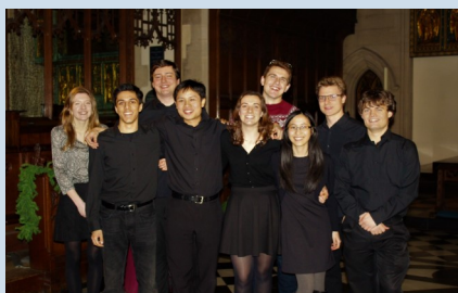
A job well done for the music team