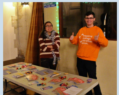
The Uncover stall up and running