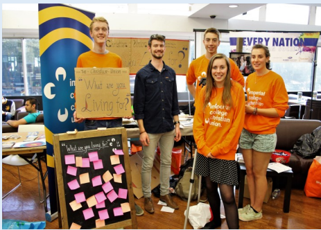
Jolly helpers at the freshers’ fair stand, with board of post-it

During the three lunch-bars that week we also looked at topics such as the meaning of university life, success and explored how Christianity was relevant all these. At the International Afternoon Tea we welcomed a number of international freshers, many of which we could befriend and engage, if not put at ease towards coming for our events.