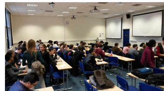
A Skeptical lunchbar

Our weekly apologetics lunchbar Skeptical has continued to flourish this term, with 30- 40 people attending each week. We've enjoyed tackling questions like 'How can Imperial students believe the Bible is reliable?', 'Can Jesus help me with my degree?' and 'How can Christians believe in hell?'. It has been encouraging to see students return week on week to explore new topics and find answers to their questions, and occasionally meet up with CU members afterwards to chat about faith more deeply.