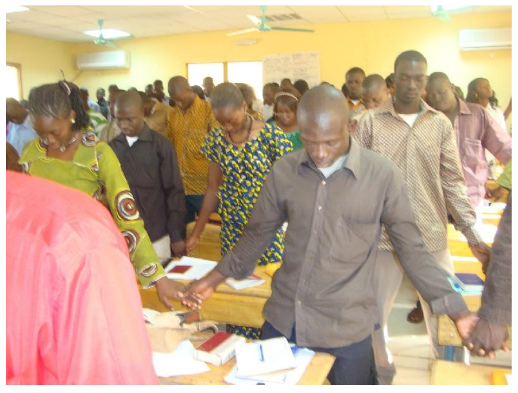
Students are praying for the Nation during the seminary last December