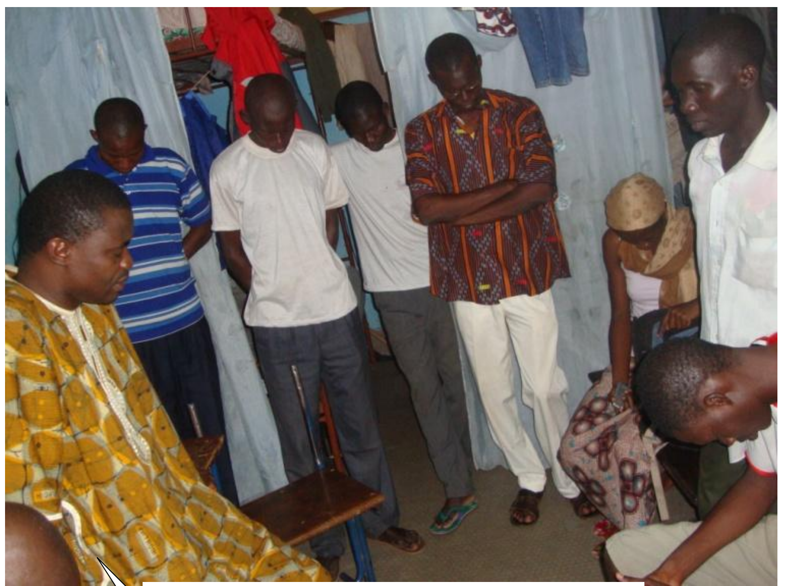
Here is a time of prayer in one room of student in campus Bamako